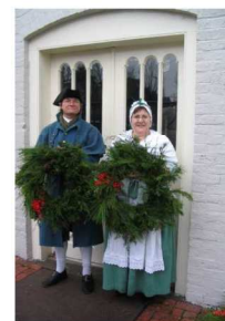
wreaths measure (side to side) approx. 20-24"

Pick Up Saturday, Dec. 2, 2017 St. George's Episcopal Church (George St. entrance) 9am - 11am