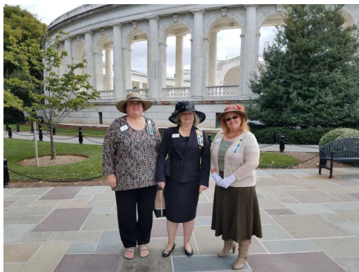
Sept. 30 VADAR wreath laying ceremony at Arlington