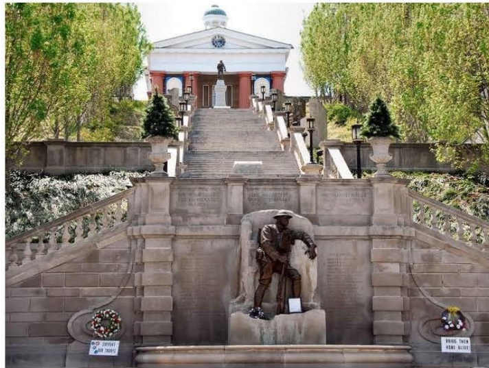
Monument Terrace - Lynchburg